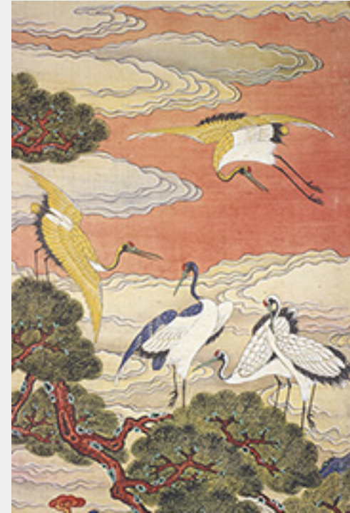
The Ten Symbols of Longevity (detail), Korean, Joseon period, ca 1881, ten-panel folding screen, ink and color on silk, Murray Warner Collection of Oriental Art.